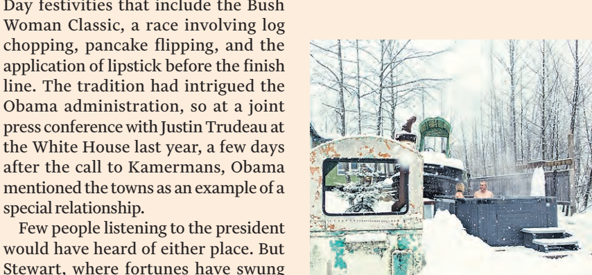
Ripley Creek Inn's outdoor hottub

arrival. I sunk almost to my waist as I climbed out of the helicopter for the first runs of the week. Wide-open Alpine faces turned into runs of perfectly spaced trees. And with small helicopters and groups of just four, plus a guide, we were able to access narrow forested couloirs that would be off-limits to the groups of up to 11 that are standard with many heli-ski operators.